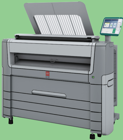
WITH OPTIONAL SCANNER EXPRESS II (MULTIFUNCTION SYSTEM)

Being able to submit files to your large format printer from anywhere can give you a big advantage when time is tight and deadlines are looming. The Océ ClearConnect software suite gives you more flexible ways to submit files to the printer. Print from your desktop via Océ Publisher Select™ software to manage complex document sets. With Océ Publisher Mobile, print from your smartphone or tablet when you are rushing to a meeting. Knowing you can print when you need to, can take some of the stress out of your work day.