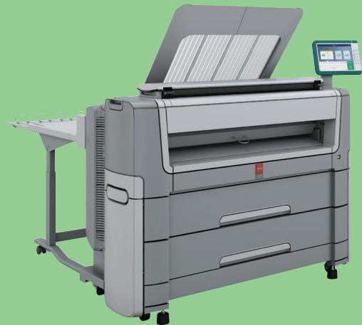
MULTIFUNCTION SYSTEM WITH OPTIONAL OCÉ DELIVERY TRAY AND OPTIONAL MEDIA DRAWER