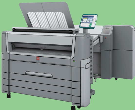
MULTIFUNCTION SYSTEM WITH OPTIONAL OCÉ 4312 FULLFOLD