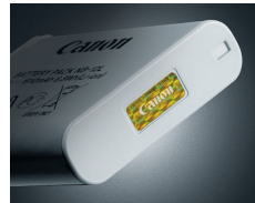
NB-12L Battery Pack

Look for the genuine Canon anti-counterfeiting hologram on the package when purchasing replacement batteries, toner, single ink tanks, and on the base of select batteries. The hologram changes when tilted back and forth.