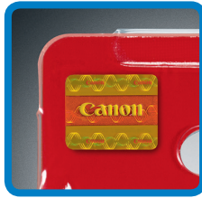
Genuine Canon Hologram

Customer safety is of utmost importance to Canon. Counterfeit goods come with all kinds of risks which you may not have even thought about. Keep safe with the following tips for spotting fake goods.