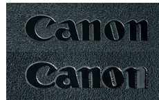
Logo on the genuine battery (top) and the counterfeit battery (bottom)

Genuine products will have clear type and logos, while counterfeits are often given away by unclear writing and spelling errors. In addition, levers and screen displays on fake Speedlites may look slightly different from genuine Speedlites (see back cover).